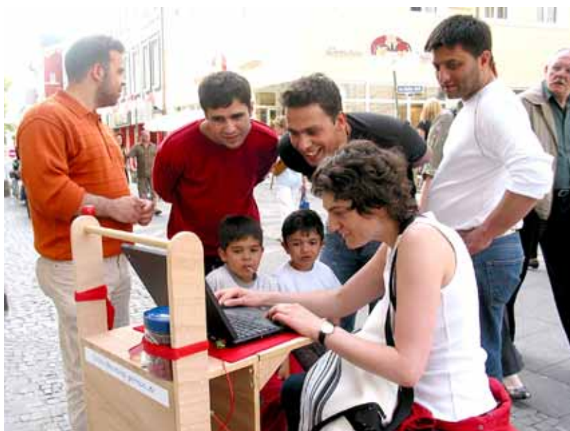
Collecting memories in the Iserlohn city centre, June 2005

The online database comprises an ever growing collection of "donated" German childhood memories, which provide a digital source of information and assistance to those, who did not have a German childhood and would like to "become German".