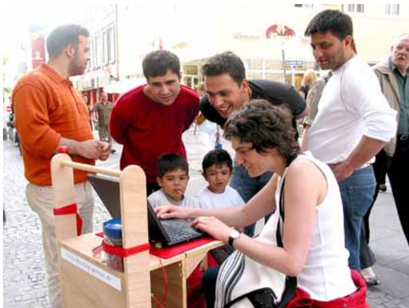
Collecting memories in the Iserlohn city centre, June 2005

The online database comprises an ever growing collection of "donated" German childhood memories, which provide a digital source of information and assistance to those, who did not have a German childhood and would like to "become German".