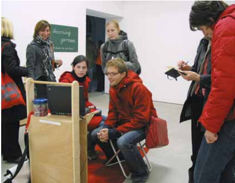
The Becoming German Info-Point at the Kasseler Kulturbahnhof, November 2004

The walkabout in the summer months of 2005 (June - September) with the Becoming German Mobile-Info-Module led me to many different parts of Germany. The walkabout took place in both public space and in an exhibition context.